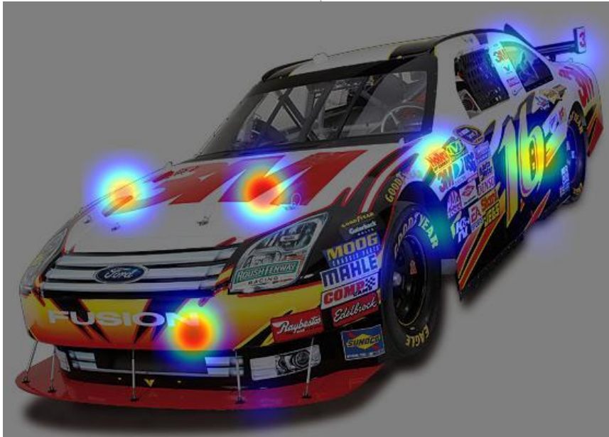
Figure 1. 3M VAS image map indicating areas most likely to attract viewers' attention

“The similarities between Windows Azure and our current development environment gave us a huge advantage and made the decision easy.”